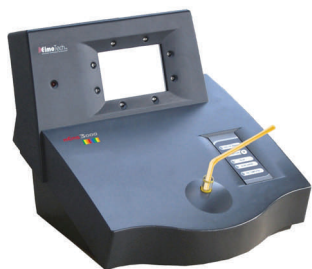
MEMS 3000 Alcohol Monitor

Minnesota Monitoring offers a full menu of monitoring services to include; House Arrest, Remote Alcohol Monitoring, Global Positioning, and Voice Verification. In addition, MMI offers various types of drug testing and detection, DNA